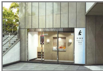
Prayer room exterior image