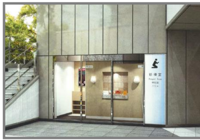
Prayer room exterior image