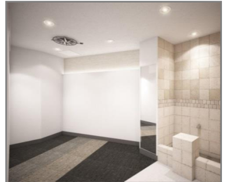
Prayer room interior image

In addition to this, the Osaka Station City has had the following initiatives for international passengers visiting Japan. In this coming October, a month frequented by international visitors, we make available at OSC Information informational brochures or floor guides compiling foreigner-oriented, recommended products and benefits offered by OSC commercial facilities, and look forward to seeing you at Osaka Station City.