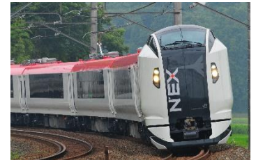
N'EX TOKYO Round Trip Ticket use area