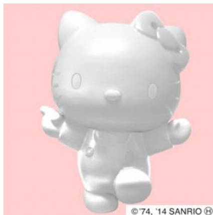
Hello Kitty white mock image