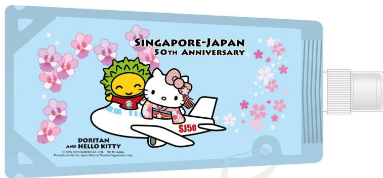
Exclusive SJ50 Hello Kitty & Dori-tan Sports Folding Water Bottle

Exclusive gift redemption and lucky draw at the Japan booth – B3, valid with purchases of group tours, free and easy packages or returned air tickets to Japan at the three-day travel event. The special gift is an exclusive SJ50 Hello Kitty & Dori-tan Sports Folding Water Bottle , while stocks last! Every redemption entitles the visitor a chance to win a state-of-the-art camera or a photo printer to preserve your fond memories in Japan. Terms and conditions apply.