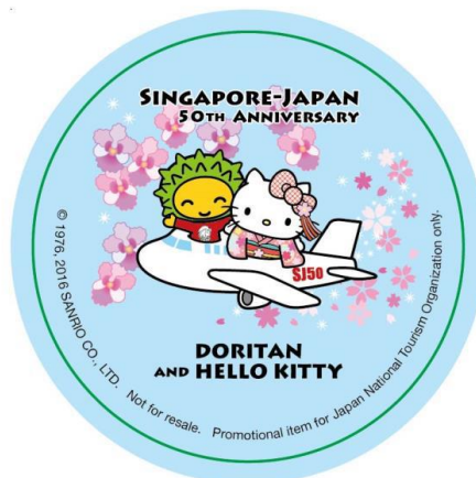
Limited Edition SJ50 Hello Kitty & Dori-tan Tin Badge

Complete a simple survey at the Japan Pavilion and receive a Limited Edition SJ50 Hello Kitty & Dori-tan Tin Badge to commemorate this special year as 2016 marks the 50th Anniversary of Singapore-Japan Diplomatic Relations. Only 500 pieces are available throughout the 3 days, while stocks last.