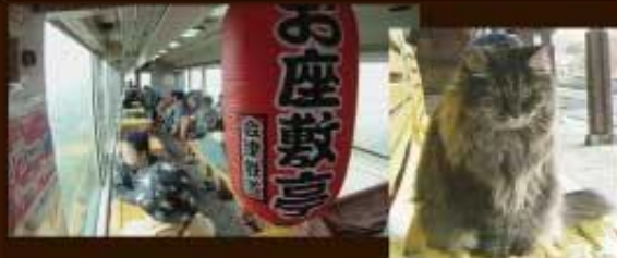
cute stationmaster "Bas"

Sep. 20 Sun 00:10/ 06:10/ 11:10/ 18:10 (UTC)