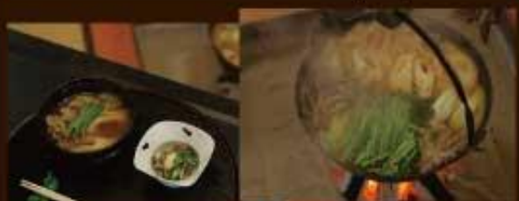
Akita's "must-eat" in Winter!

Sep. 18 Fri 14:30/ 20:30 19 Sat 02:10/ 08:10 (UTC)