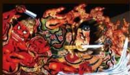
Visually appealing "Dashi"!

Sep. 21 Mon 23:30/ 22 Tue 05:30/ 12:30/ 17:30 (UTC)