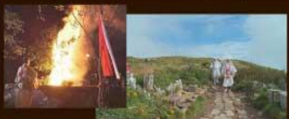
Hidden training spot for Yamabushi

[Part 1] Sep. 3 Thu 14:30 (UTC) [Part 2] Sep. 10 Thu 14:30 (UTC)