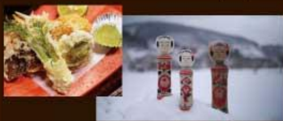
Hot springs and folk art "Kokeshi Dolls"

Aug. 31 Mon 23:30/ Sep. 1 Tue 05:30/ 12:30/ 17:30 (UTC)