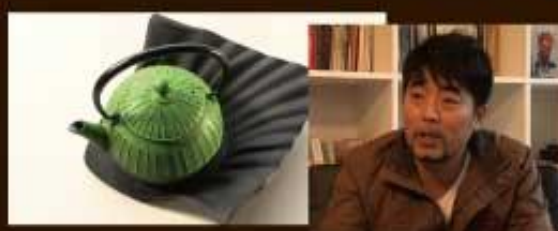
Traditional teapot "Nambu Tekki"

Sep. 2 Wed 00:30/ 06:30/ 13:30/ 18:30 (UTC)