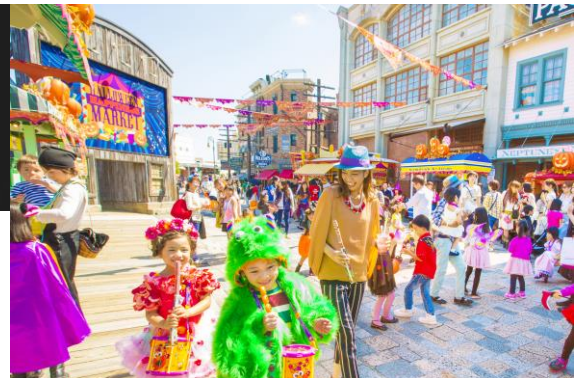
↑ Last year's Halloween Happiness Market