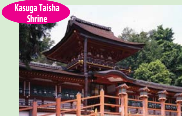
Kasuga Taisha Shrine A shrine established in 768. There are approximately 3,000 lanterns in the precinct. ▶ KINTETSU-NARA Station → Approx. 10-minute walk from Daibutsuden Kasugataisha-mae bus stop, or in front of Kasuga Taisha Honden bus stop.