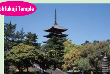
Kohfukuji Temple In the temple grounds is the five-storied pagoda, which is a well known symbol of Nara. The National Treasure Hall houses many important cultural properties and national treasures, including the Ashura Image. ▶ KINTETSU-NARA Station → Approx. 5-minute walk, or take the bus to Kencho-mae bus stop