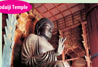
Todayji Temple The Great Buddha Hall, one of the largest wooden buildings in the world, is dedicated to the Great Buddha. ▶ KINTETSU-NARA Station → Approx. 20-minute walk, or approx. 6-minute walk from Daibutsuden Kasugataisha-mae bus stop on the Nara Kotsu Bus.