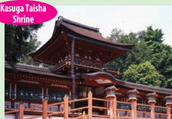
Kasuga Taisha Shrine A shrine established in 768. There are approximately 3,000 lanterns in the precinct. ▶ KINTETSU-NARA Station → Approx. 10-minute walk from Daibutsuden Kasugataisha-mae bus stop, or in front of Kasuga Taisha Honden bus stop.