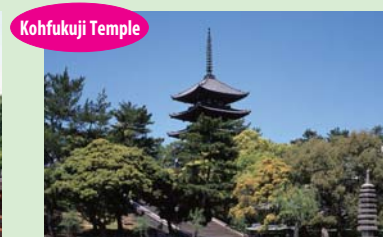
Kohfukuji Temple In the temple grounds is the five-storied pagoda, which is a well known symbol of Nara. The National Treasure Hall houses many important cultural properties and national treasures, including the Ashura Image. ▶ KINTETSU-NARA Station → Approx. 5-minute walk, or take the bus to Kencho-mae bus stop